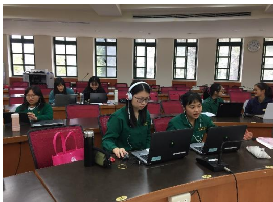
▲ Online Exchange Program